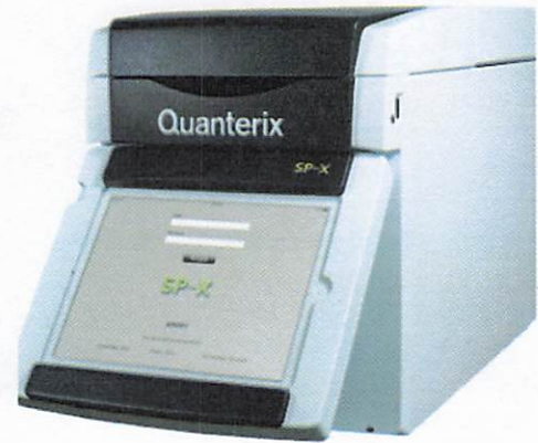
Data below represents results generated on the SP-X™ Imaging and Analysis System