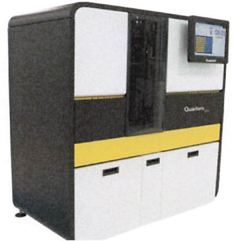
Data below represents results generated on the Simoa® HD-X Analyzer.