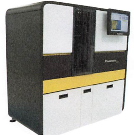
Data below represents results generated on the Simoa® HD-X Analyzer.