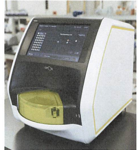
Data below represents results generated on the Simoa® SR-X Analyzer.