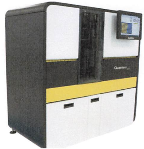
Data below represents results generated on the Simoa® HD-X Analyzer.