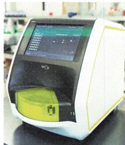
Data below represents results generated on the Simoa® SR-X Analyzer.