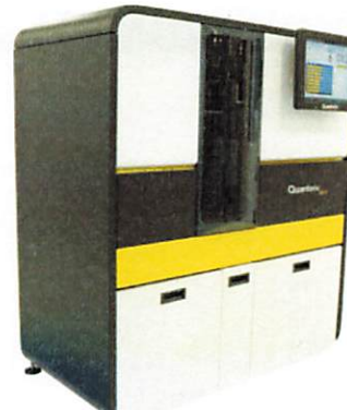
Data below represents results generated on the Simoa® HD-X Analyzer.