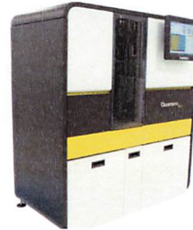
Data below represents results generated on the Simoa HD-X® Analyzer.