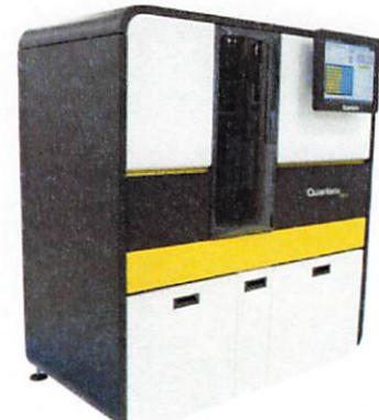
Data below represents results generated on the Simoa® HD-X Analyzer.