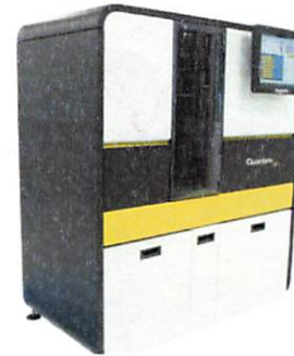
Data below represents results generated on the Simoa HD-X® Analyzer.