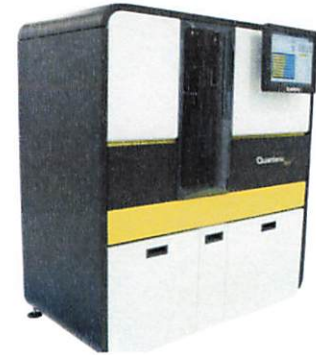
Data below represents results generated on the Simoa® HD-X Analyzer.