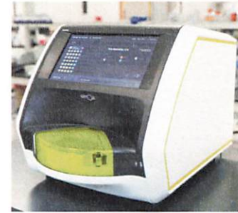
Data below represents results generated on the Simoa® SR-X Analyzer.