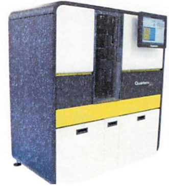
Data below represents results generated on the Simoa® HD-X Analyzer.