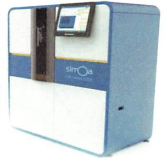
Data below represents results generated on the Simoa™ HD-1 Analyzer.