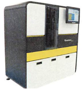
Data below represents results generated on the Simoa™ HD-X Analyzer.