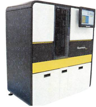
Data below represents results generated on the Simoa™ HD-X Analyzer.