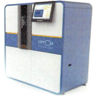
Data below represents results generated on the Simoa™ HD-X Analyzer.